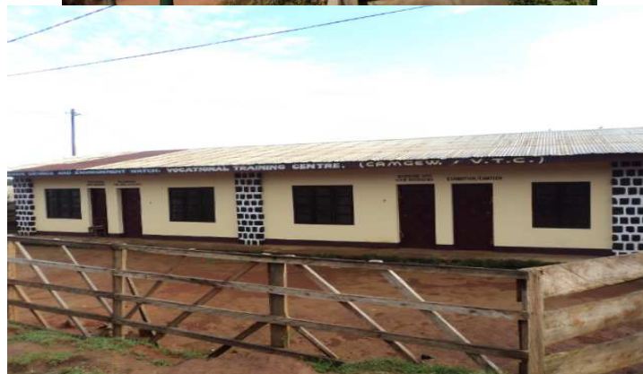
CAMGEW-Vocational Training Centre (VTC) Presentation