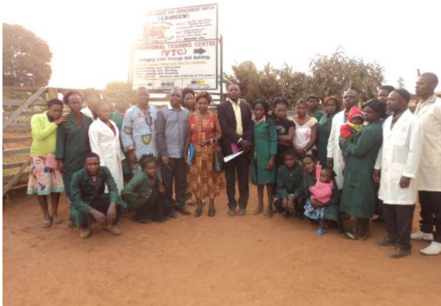
Delegation from the Regional Delegation of MINEFOP with CAMGEW-VTC Team in front of the VTC Campus