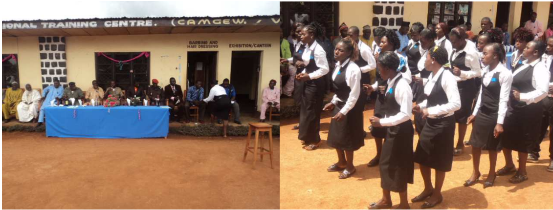
Students sing a welcome song to all people present in the training centre.

organized the Open-Door-day. Many parents promised to send their children to VTC when they finish from elementary school and also encourage those that had earlier finished elementary school and had nothing doing to come and register and receive trainings in any vocational course.