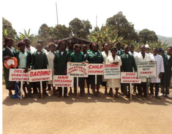
CAMGEW-VTC staff and students in National Youth Day Celebration.