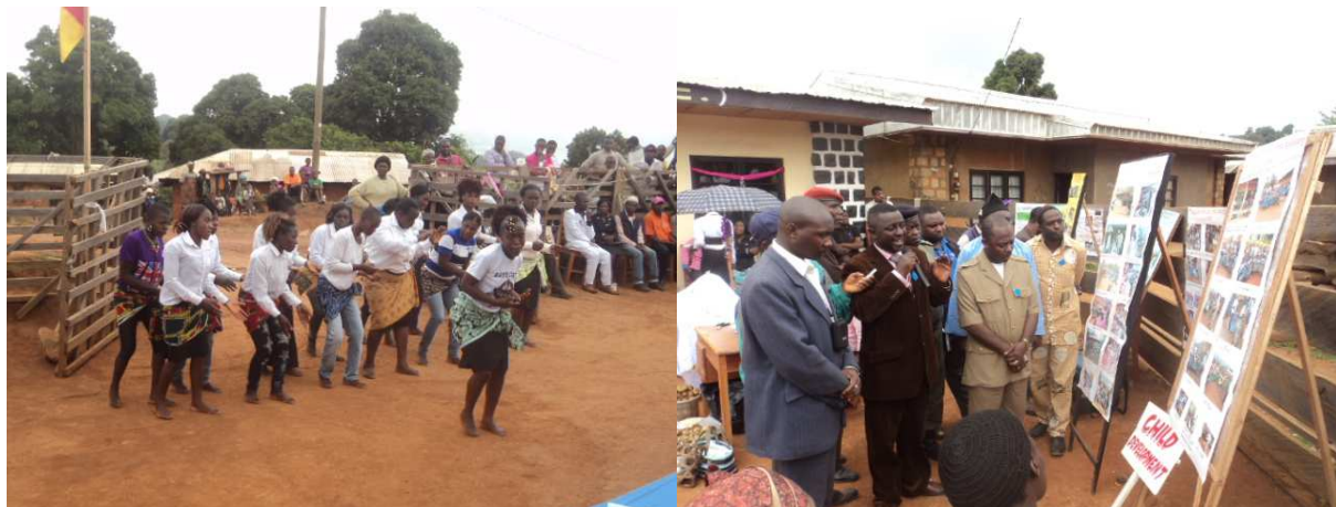
VTC students in a traditional dance and invitees visit CAMGEW demonstrated works