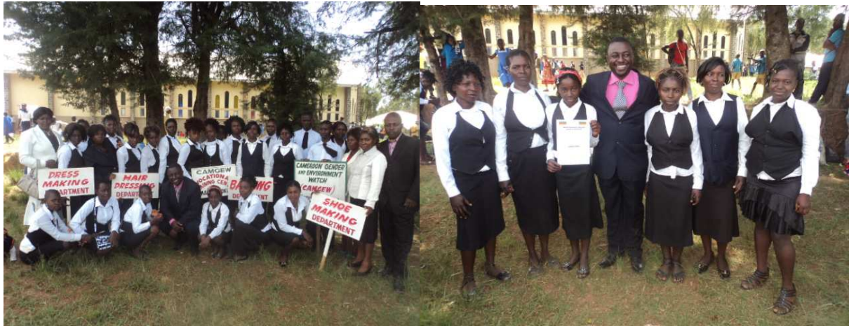
CAMGEW-VTC team join CAMGEW Director to celebrate the award.