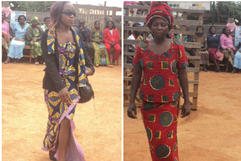
Students do fashion parade on what CAMGEW-VTC produces during the Open Door day 2014.