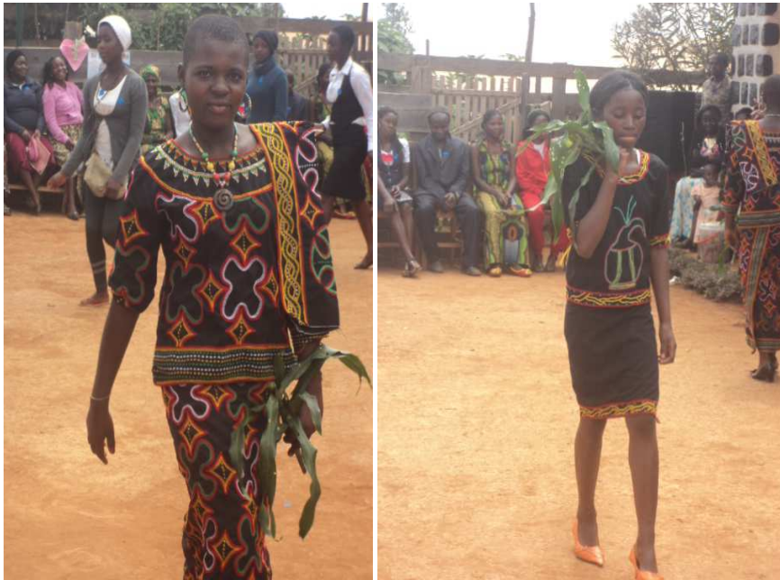
Students do fashion parade on what CAMGEW-VTC produces during the Open Door day 2014.