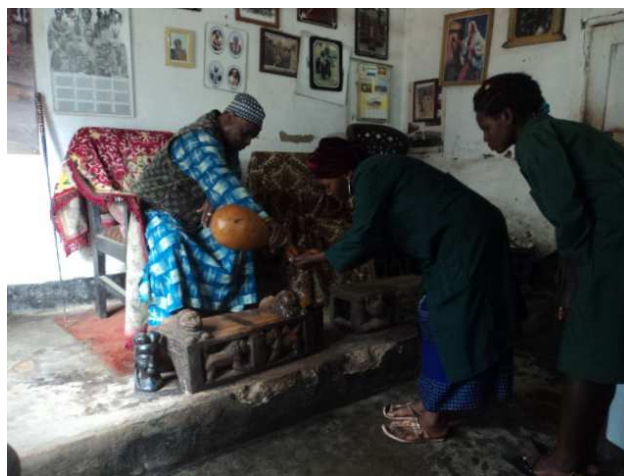
The Fon pouring out some “palace water” (palm wine) for students to drink