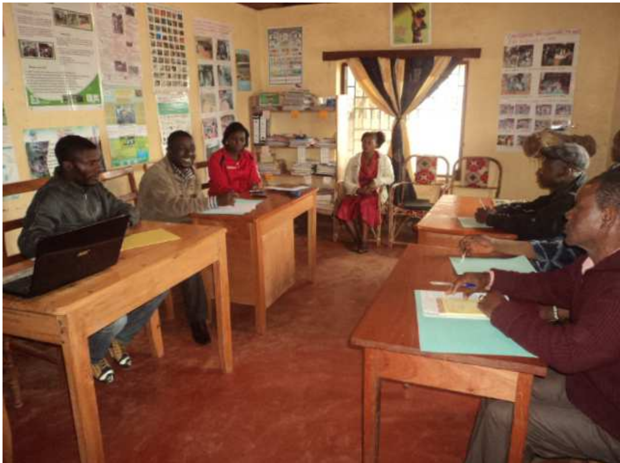
Participants at the local Board of Directors meeting

CAMGEW administration saw the need for CAMGEW-VTC to have a local board of directors that include local stakeholders, CAMGEW-VTC staff representative, CAMGEW administration and the representative of the students. This local board was to help in the functioning of CAMGEW-VTC in discipline of staff and students, raising funds locally, follow-up of the payment of small requested fees from students, lobby local authorities like Fon to get land to build a permanent site of CAMGEW-VTC and participation in the recruitment of CAMGEW staff. CAMGEW decided that the functioning of the Vocational Centre be different from the whole organisation. CAMGEW administration identified 5 key community members, 1 CAMGEW-VTC staff and 1 CAMGEW-VTC student to form the local board. This meeting was held on the 18 th of October 2014 and members were elected into various positions.