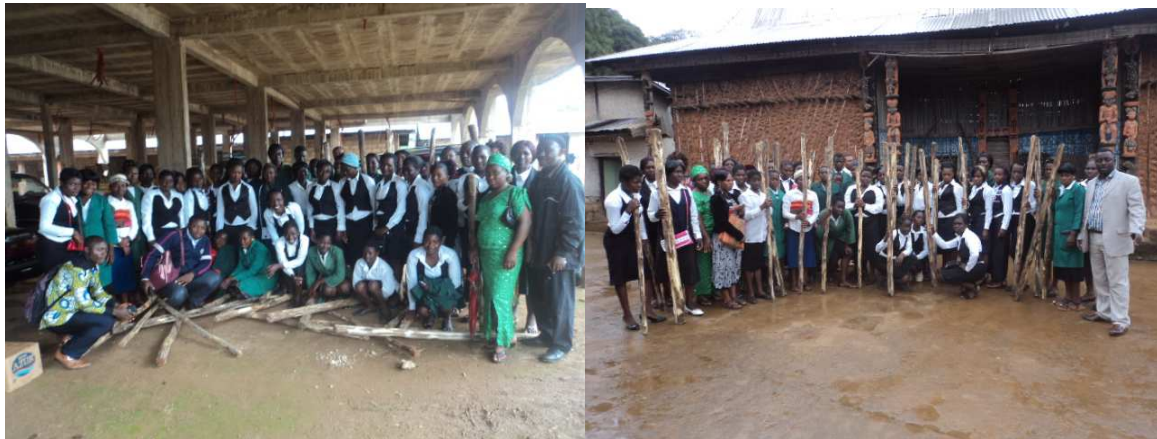
Students and staff members in the palace to present firewood to the Fon

amazed with our number. It was a cheap way of good publicity. We saw it important to make it a yearly event. Our students and staff liked it. The visit took place from 3:00PM to 6:00PM. CAMGEW-VTC staff and students were highly welcomed in the palace. The Fon of Oku granted them an audience of 3 hours which is something that rarely happens in the Oku Fandom. CAMGEW conservation, child development, poverty alleviation and Vocational training activities were appreciated by His Royal Highness. These activities promoted development in Oku. The Fon in return gave CAMGEW staff and students palm wine which they drank together as tradition demands. CAMGEW-VTC students sang songs in the palace yard and danced. Palace children and women, palace attendants and surrounding population watched CAMGEW with admiration. His Royal Highness the Fon of Oku was overwhelmed by the works of CAMGEW and by the growth of the VTC. He acknowledged the fact the students' number was increasing and also added that there was need for the community members to send more children to vocational centres. The more community youths had a job to do, the lesser they got involved in delinquent activities. This event was covered by the Oku Community Radio and broadcasted many times. The Fon promised CAMGEW-VTC a piece of land to build a permanent structure. The activity ended with Fon giving some light refreshment to CAMGEW-VTC students and Staff.