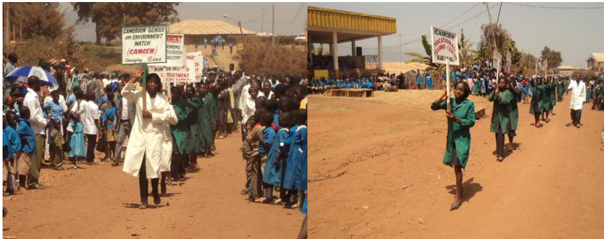
CAMGEW VTC celebrate 50 years of reunification of Cameroon