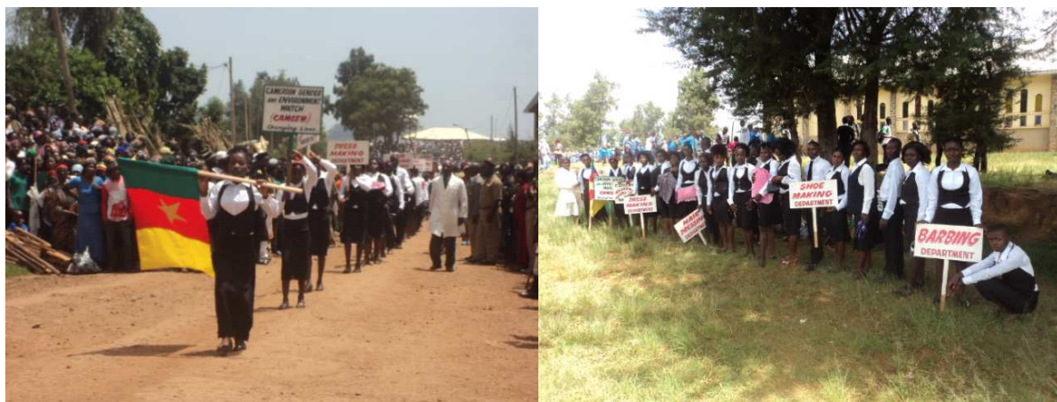
CAMGEW VTC participate in National Day Celebration